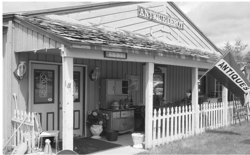
The Antique Depot is located at 5030 County Road 612 in Lewiston (across from Family Fare) and is open Monday through Saturday from 11am to 6pm and Sunday from 12:30pm to 5:30pm.