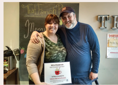
Congratulations to That French Place, the winner of the 2016 Charlevoix Hot Cocoa Contest that took place during the Holiday Merchant Open House on Saturday, December 3rd.

The 2016 Charlevoix Hot Cocoa Contest offered a wonderful variety of delicious cocoa for all to sample and enjoy. Those that followed the Cocoa